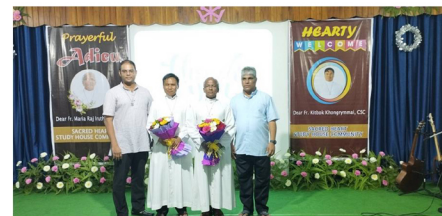
Reported by House Correspondent

After the short felicitation program, the fellowship meal was shared by all.